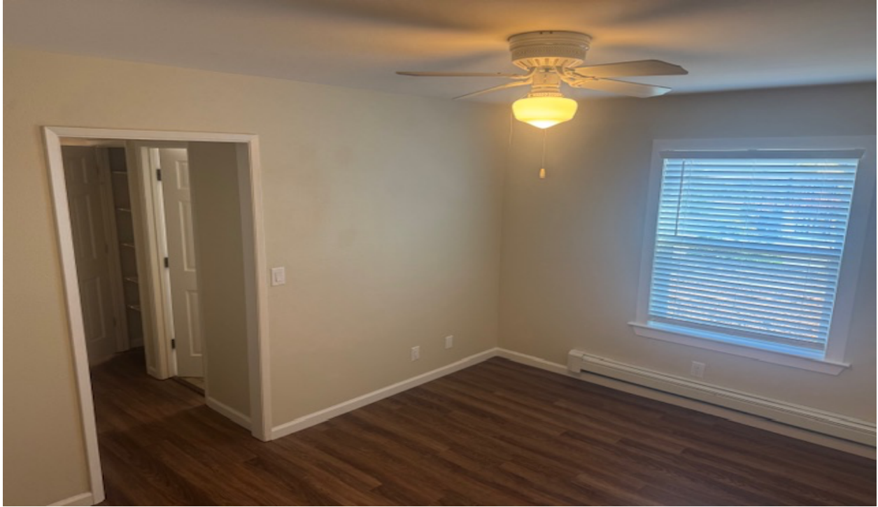
Bedroom downstairs next to bathroom