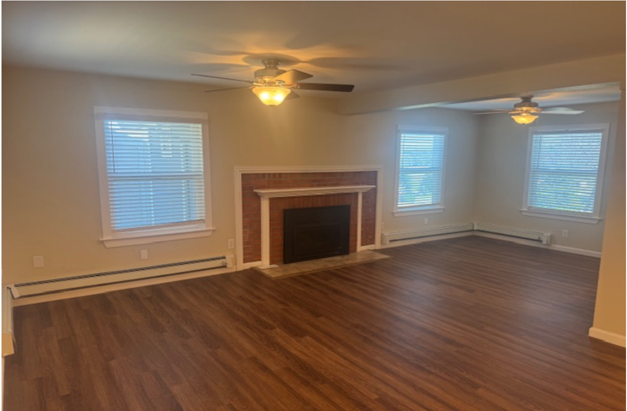
Living room space