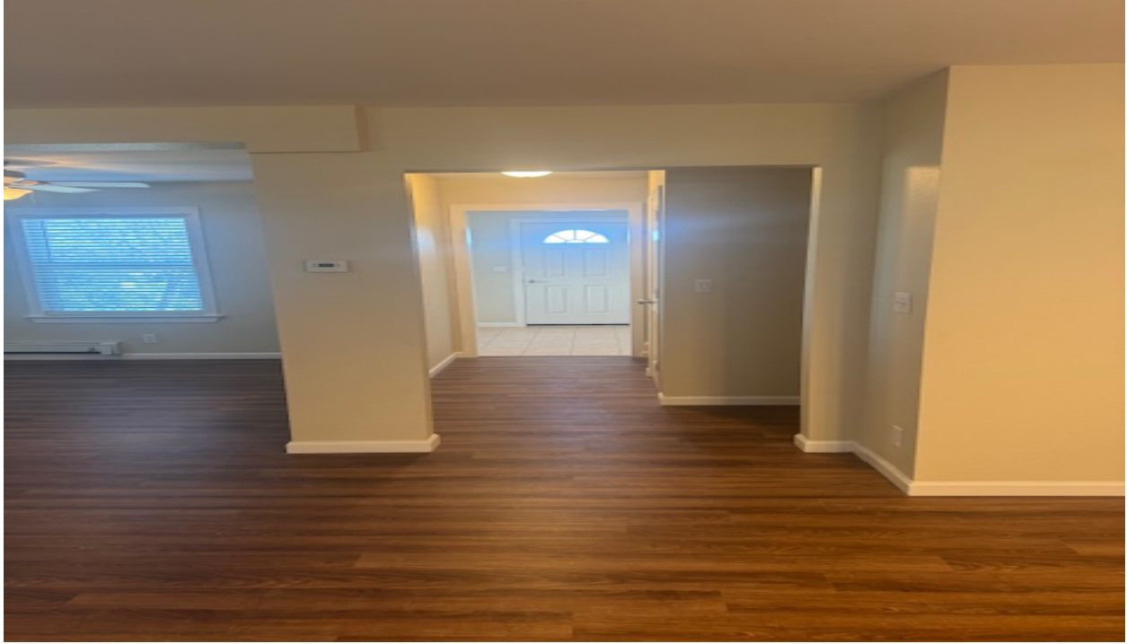
Entrance Space Center